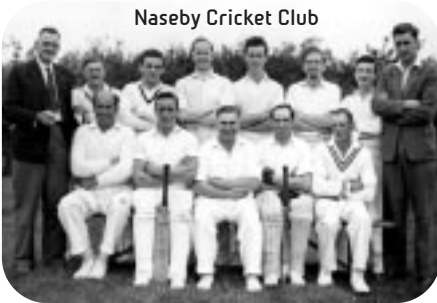
Naseby Cricket Club

There were also several farms in and around Naseby where crops were grown and sheep, cattle and other livestock were bred to produce dairy products. Horses were used for ploughing until farmers could afford to buy their first tractors which helped to speed the job up! The cost of a tractor was about £130 back then. Most people in the village had their own gardens or allotments for growing their own crops and the village was fairly self-sufficient.