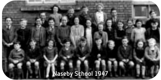
Naseby School 1947

Every Tuesday was Market Day in Market Harborough and the cattle market was on at the same time with local farmers selling and buying cattle, unlike today when things are very much scaled down. The women would go and collect the shopping and rations on a Saturday afternoon from Market Harborough by bus. Things that we take for granted such as bananas and oranges were in very short supply back then.