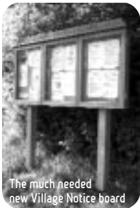
The much needed new Village Notice board

The long-awaited Notice Board (situated in School Lane, adjacent to the School pathway) is ideally